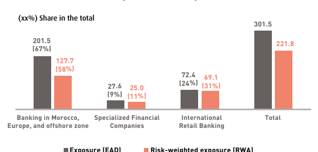
Breakdown of credit risk by business activity in 2015 (in MAD billions)

3) Calculated as 8% of risk-weighted assets.