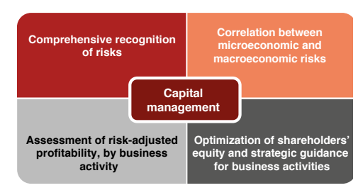
Targets for «Capital Management»

The capital-management policy extends beyond the regulatory framework, to overseeing investments and their returns (calculations of IRR, dividend forecasts, divestments, tax engineering, etc.), thereby ensuring optimal capital allocation for all business lines and fulfilling capital requirements for both strategic goals and regulatory changes.