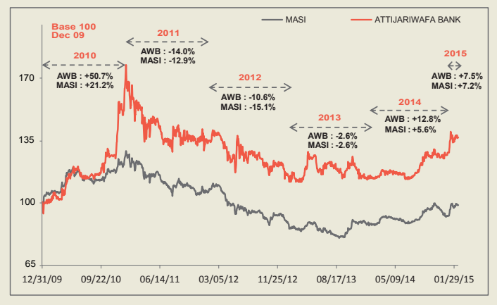
Largest bank by market capitalisation in Morocco: MAD 75.3 bn as of February 10, 2015.